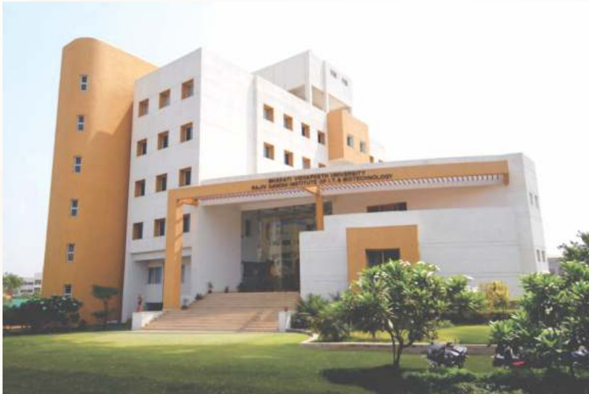
Rajiv Gandhi Institute of I. T. & Biotechnology