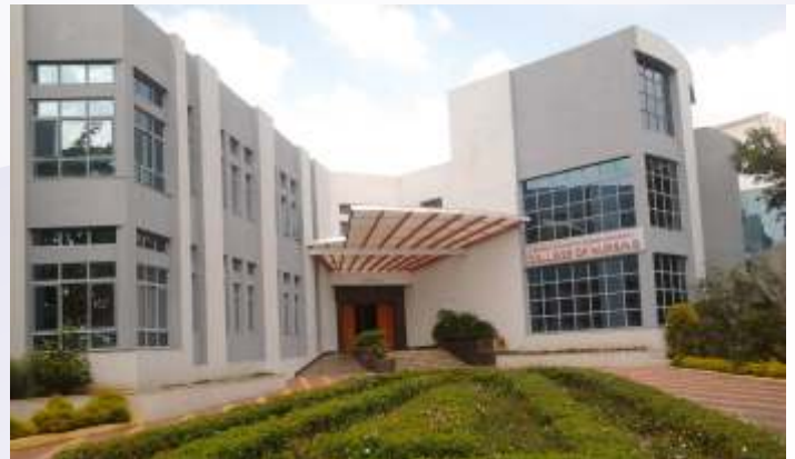
College of Nursing, Sangli