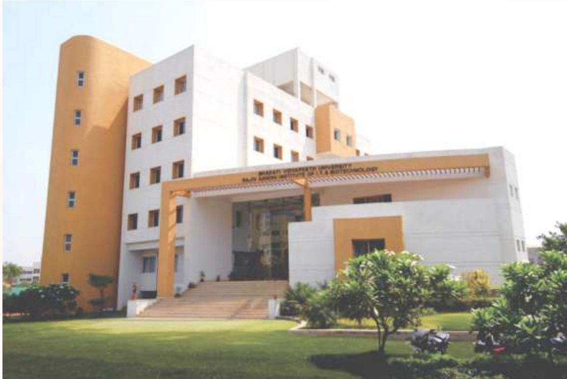
Rajiv Gandhi Institute of I. T. & Biotechnology