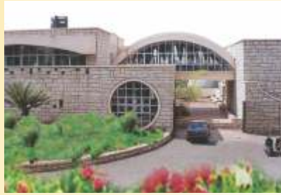
INSTITUTE OF ENVIRONMENT EDUCATION & RESEARCH