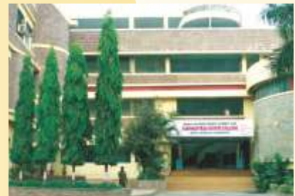
YASHAWANTRAO MOHITE COLLEGE, PUNE