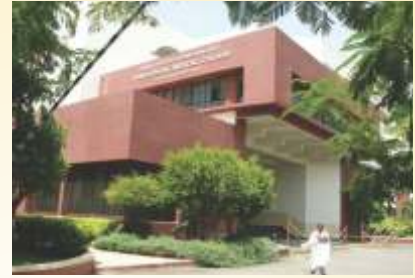
HOMOEOPATHIC MEDICAL COLLEGE, PUNE