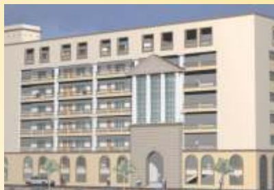
NEW LAW COLLEGE, PUNE