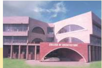
COLLEGE OF ARCHITECTURE, PUNE