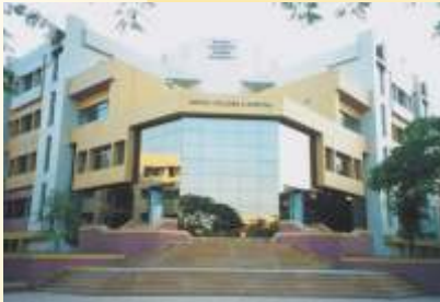
DENTAL COLLEGE & HOSPITAL, PUNE