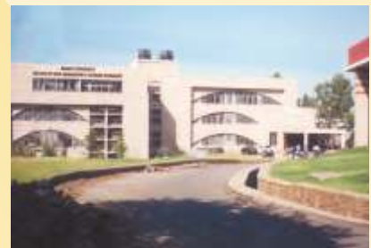
INSTITUTE OF HOTEL MANAGEMENT & CATERING TECHNOLOGY, PUNE