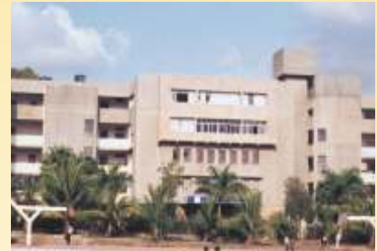
INSTITUTE OF MANAGEMENT AND ENTREPRENEURSHIP DEVELOPMENT, PUNE