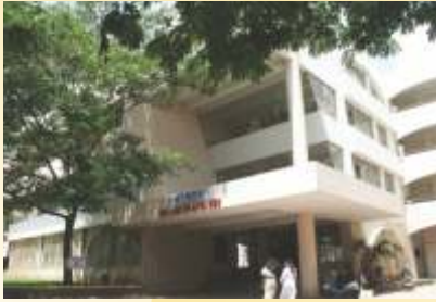
COLLEGE OF AYURVED, PUNE