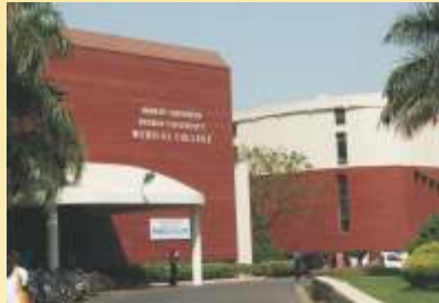
MEDICAL COLLEGE, PUNE