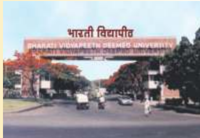
DHANKAWADI CAMPUS GATE, PUNE