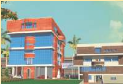
POONA COLLEGE OF PHARMACY, PUNE