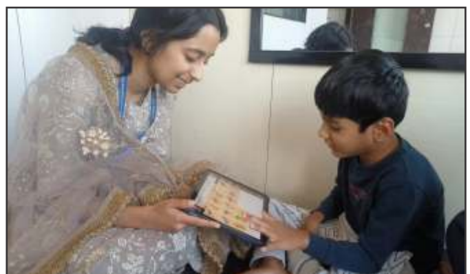
Use of Augmentative and Alternative (AAC) device for paediatric speech and language therapy