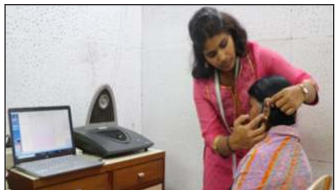
Real Year Measurement