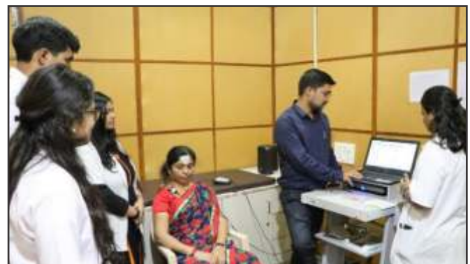
Clinical Teaching in Audiology