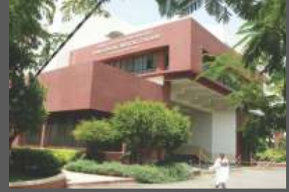
HOMOEOPATHIC MEDICAL COLLEGE, PUNE