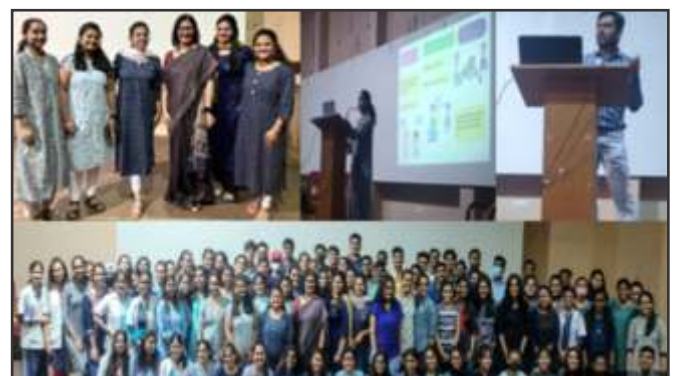
Workshop for students on Autism Spectrum Disorder