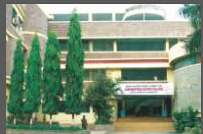
YASHAWANTRAO MOHITE COLLEGE, PUNE