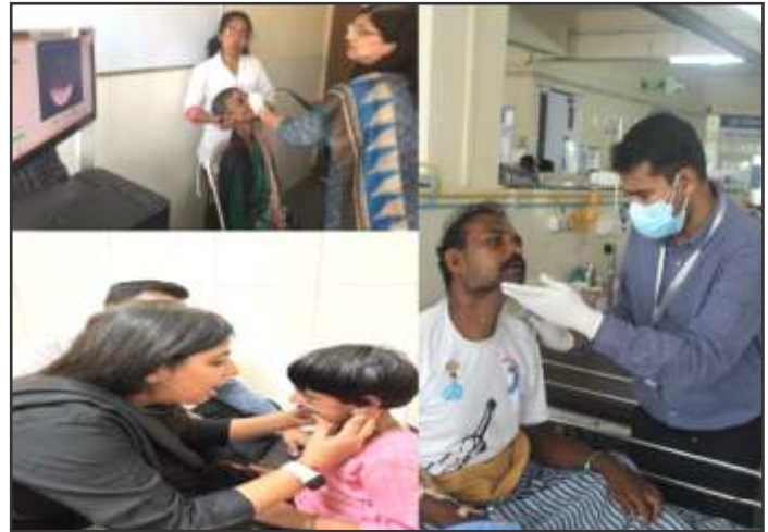
Assessment & Management of Feeding and Swallowing Disorders