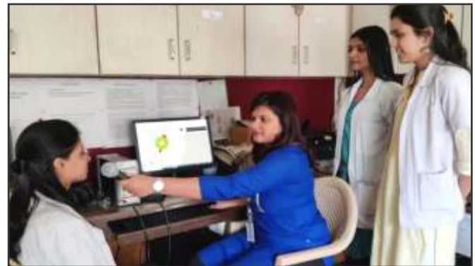
Clinical teaching in Speech Language Pathology