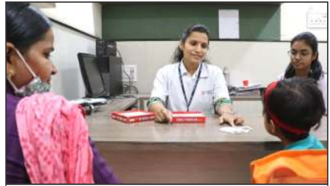
Paediatric Speech and Language Assessment

Management of individuals with speech, language, literacy, cognitive communication and swallowing disorders.