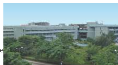
Engineering and Technology