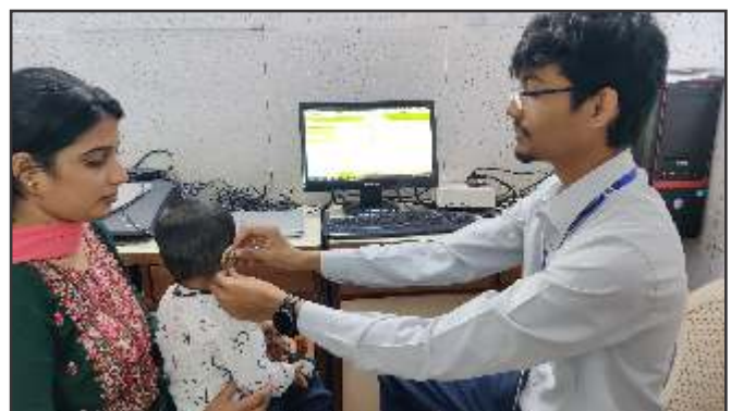
Paediatric Hearing Aid Trial