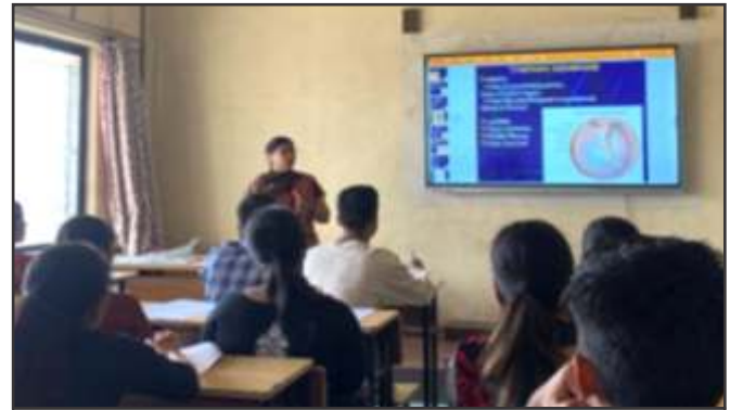
ICT enable classroom teaching