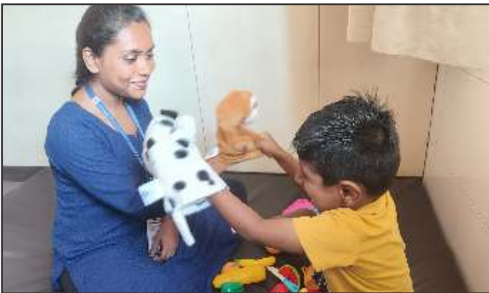
Therapy for speech sound correction