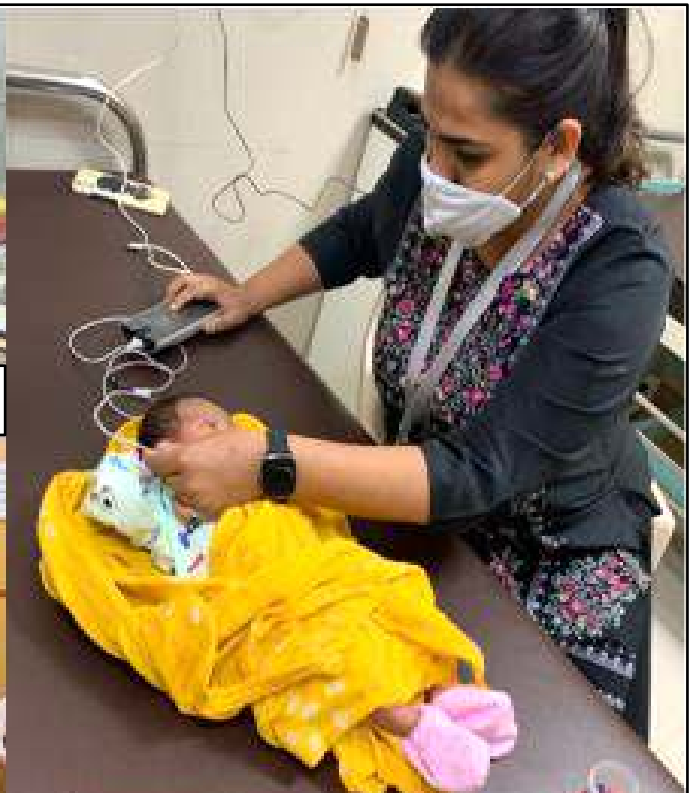
New-born Hearing Screening using Otoacoustic Emissions (OAE)