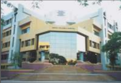
DENTAL COLLEGE & HOSPITAL, PUNE