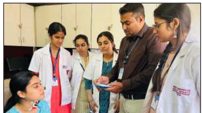
Clinical Teaching Using Vital Stim