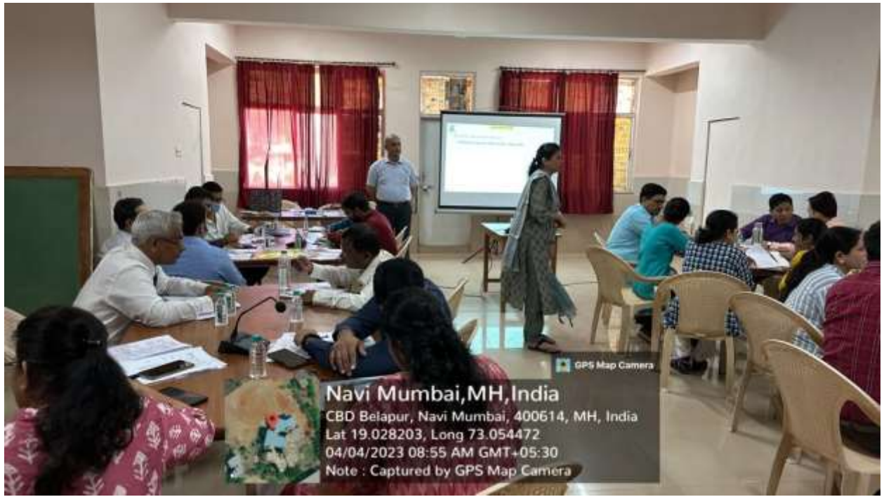
GPS Map Camera Navi Mumbai, MH, India CBD Belapur, Navi Mumbai, 400614, MH, India Lat 19.028203, Long 73.054472 04/04/2023 08:55 AM GMT+05:30