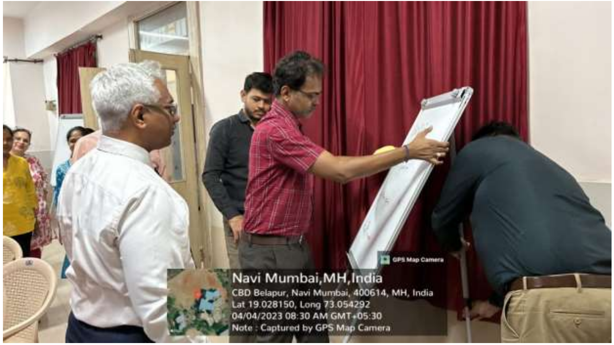
GPS Map Camera Navi Mumbai, MH, India CBD Belapur, Navi Mumbai, 400614, MH, India Lat 19.028150, Long 73.054292 04/04/2023 08:30 AM GMT+05:30