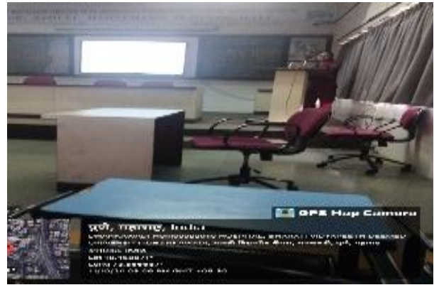
Sneha explaining Renal calculi