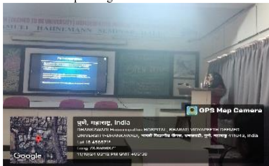
Vaishnavi explaining RHD