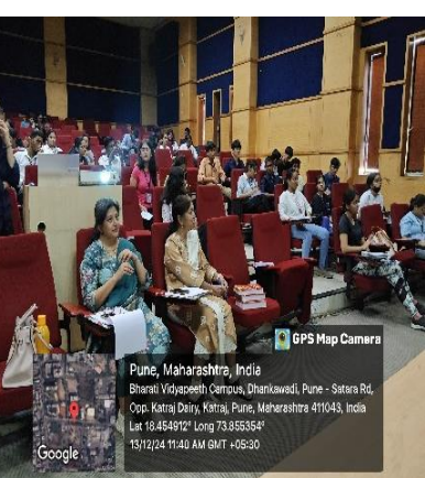
Interaction with Faculty.