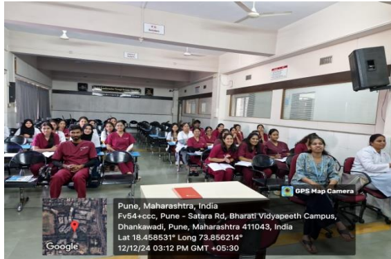
Faculty members attending the session