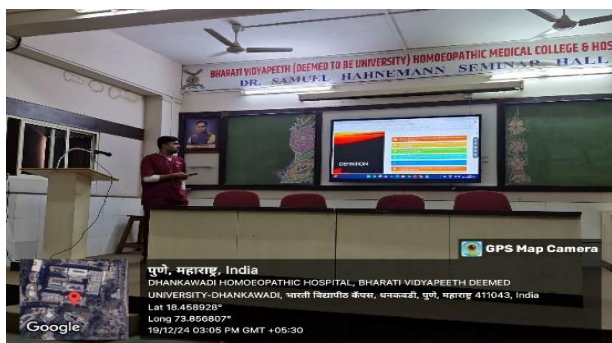
Intern Shubham explaining psoriasis