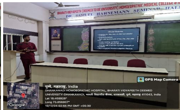
Intern Dhawal explaining cholelithiasis