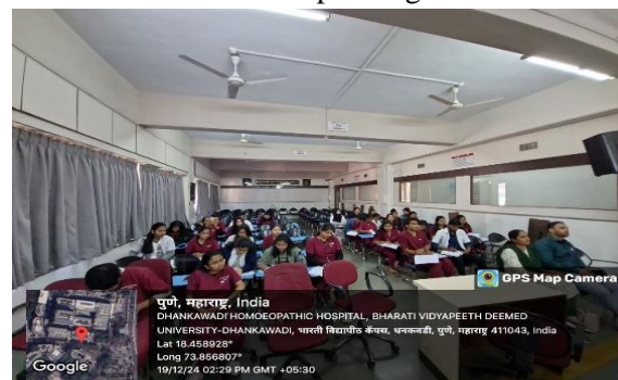
Attendees of the clinical session