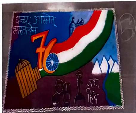
5- Swatantra ke Adbhut Rang

[Signature] PRINCIPAL Bharati Vidyapeeth (Deemed to be University) School of Physiotherapy Pune-Satara Road, Pune-411 043.