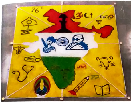
1- Bharat ke Rang