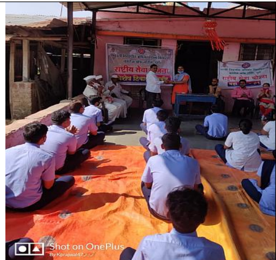
Felicitation of the Guest – NSS Coordinator