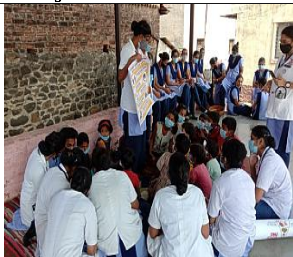
Health check-up and health Education