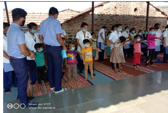
Children in Action