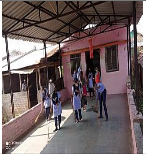
Health Education and Cleaning the areas