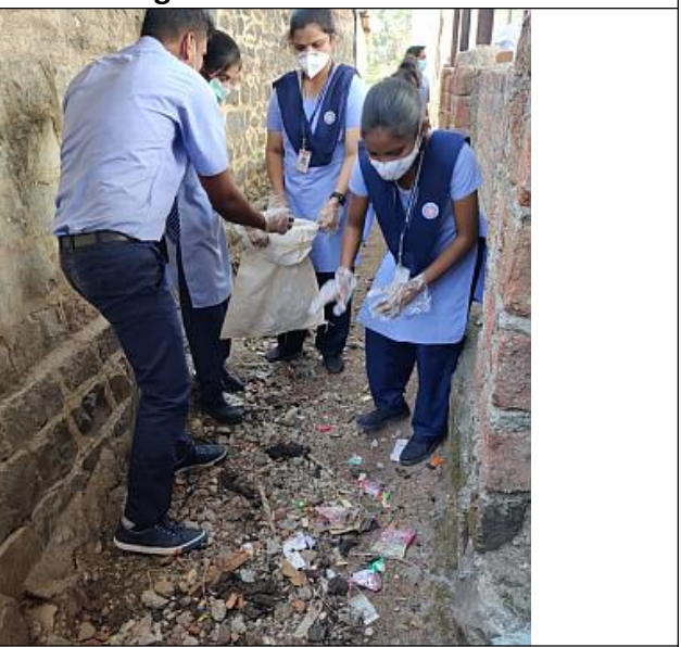
Cleaning the temple and passages