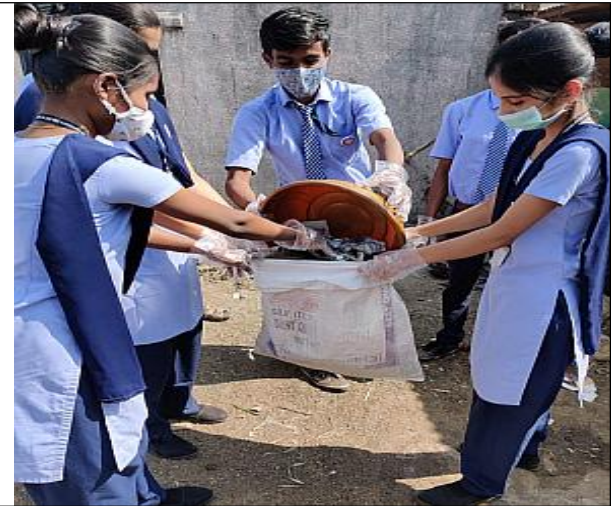
Cleaning the Areas and collecting the debris