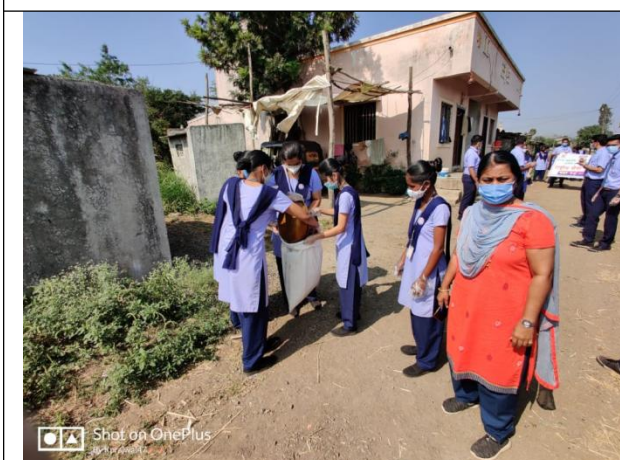
Cleaning of the Village Area