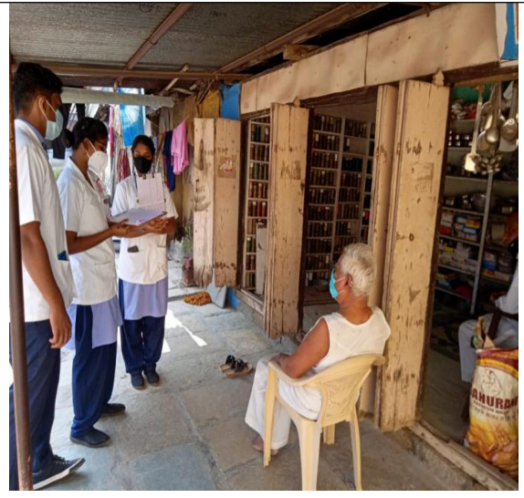
Elderly Care- Home Visit