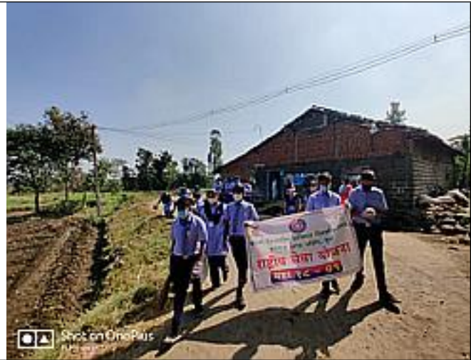
volunteers in action