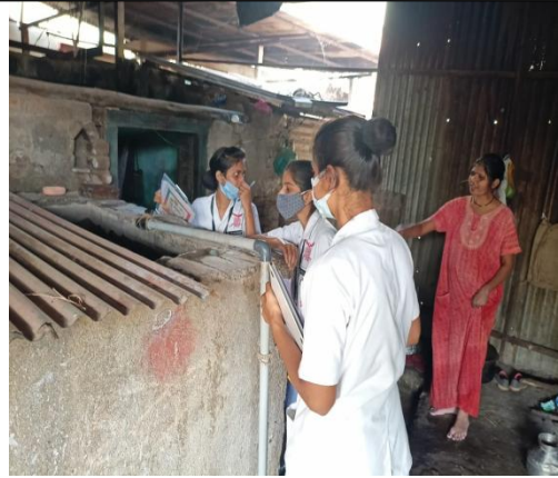
Malarial prevalence Survey