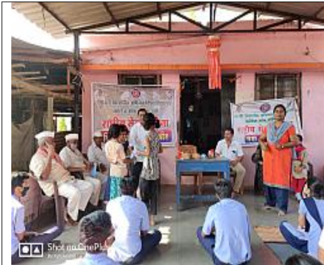
Inaugural Speech – NSS Co-ordinator