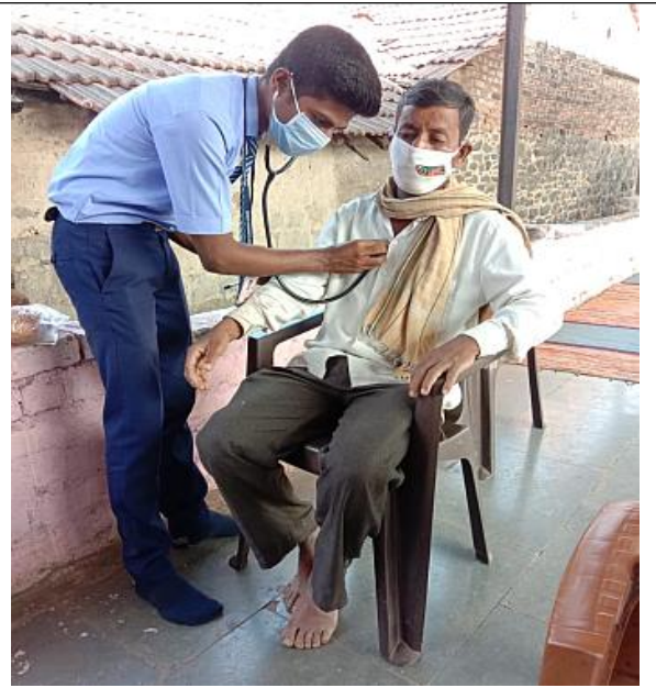
Health check Up