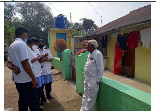
Elderly Care – Home Visit