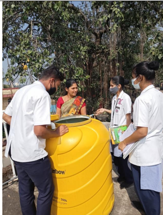
Malarial prevalence Survey