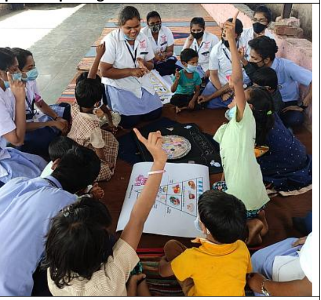
Health talk to the children by NSS Volunteers