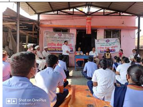
Felicitation of guest and speech by the guest - NSS Camp