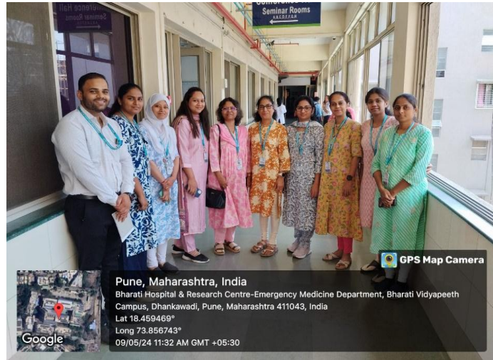
Faculty members of BVDUHCM who attended the workshop.