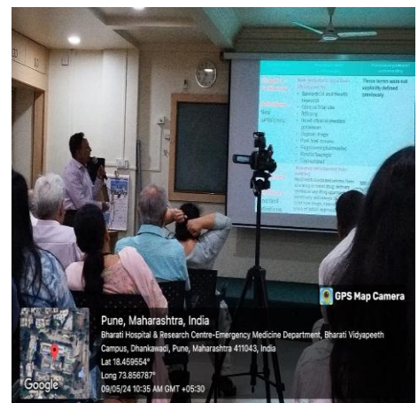
Verma highlighting latest developments