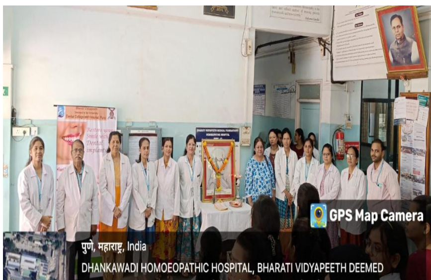
CAMP INAGURATION BY ORGANISING DEPARTMENTS.

The camp was conducted by the faculty members, 16 th batch PG Scholars, and 45 th and 46 th batch Interns & Hospital staff.