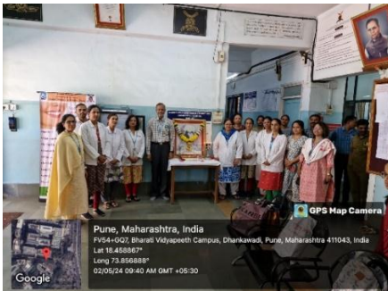
Camp Inauguration by I/C Principal with Faculty Members, PG & Interns