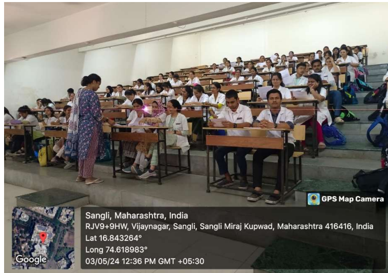
Conducting mock Student Satisfaction Survey as a part of Orientation Program from students