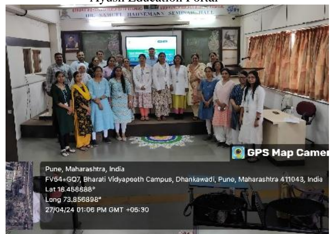
Faculties attended training program