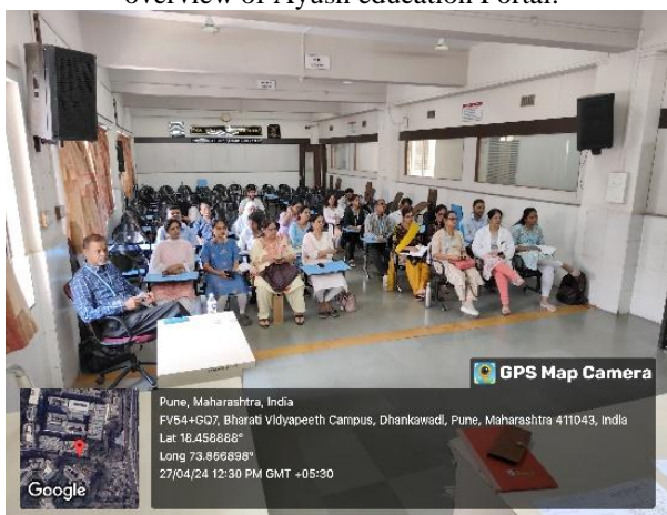
Faculties during training program