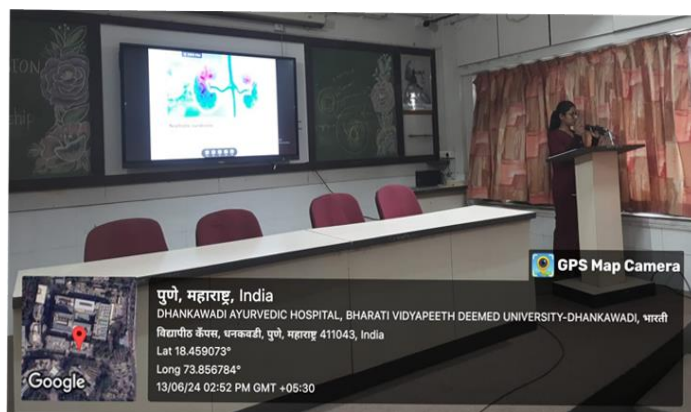
Ashwini Andhale, presenting clinical session on Nephrotic with Homoeopathic approach