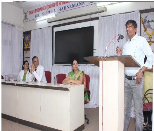
The parents expressed their thoughts