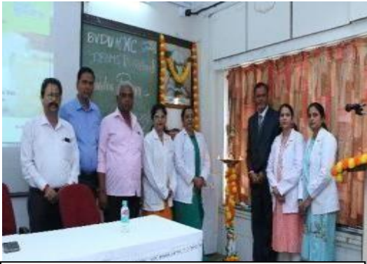
Lamp Lighting by all Dignitaries on first day of Foundation Program