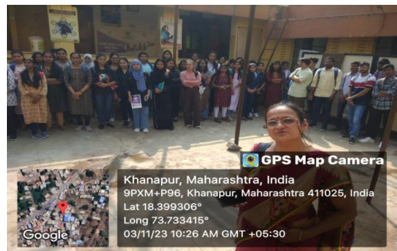
Khanapur, Maharashtra, India 9PXM+P96, Khanapur, Maharashtra 411025, India Lat 18.399306° Long 73.733415° 03/11/23 10:26 AM GMT +05:30 GPS Map Camera Google