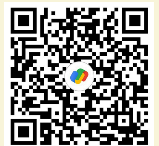
QR code for Payment