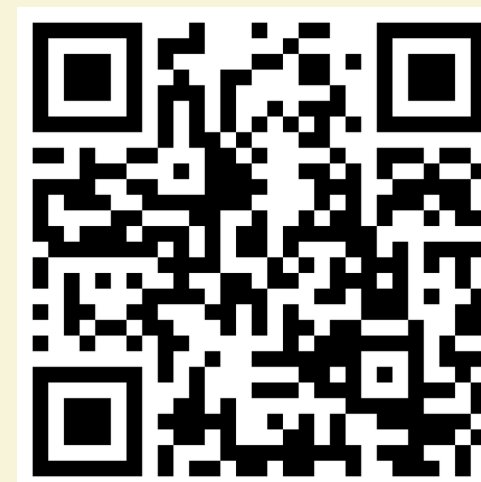
QR Code for Registration