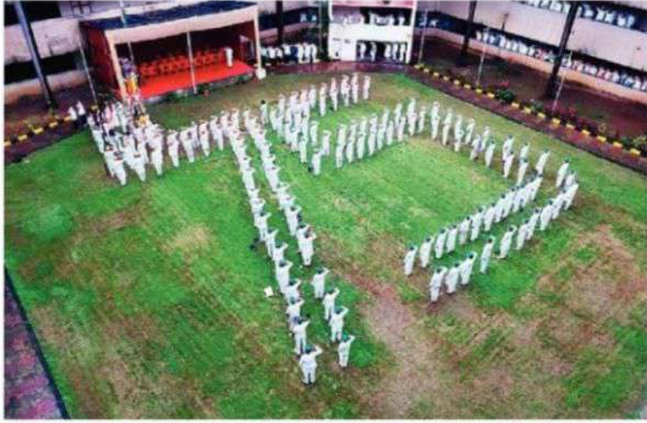
स्वातंत्र्य दिनानिमित्त स्वारघरमधील भारती विद्यापीठातील कर्मचाऱ्यांनी ७५ असा आकडा करून मानवंदना दिली.