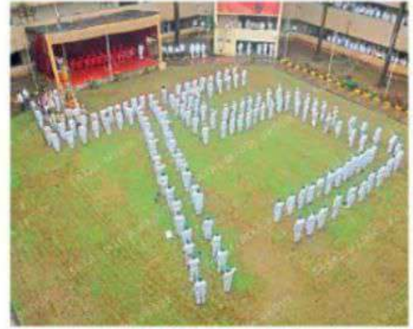
पनवेल : खारपरमथोल अभियांत्रिकीच्या विद्यार्थ्यांनी मानवी साखळी तयार केली.