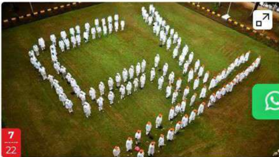
Celebrating freedom at Bharati Vidyapeeth college Kharghar in Navi Mumbai