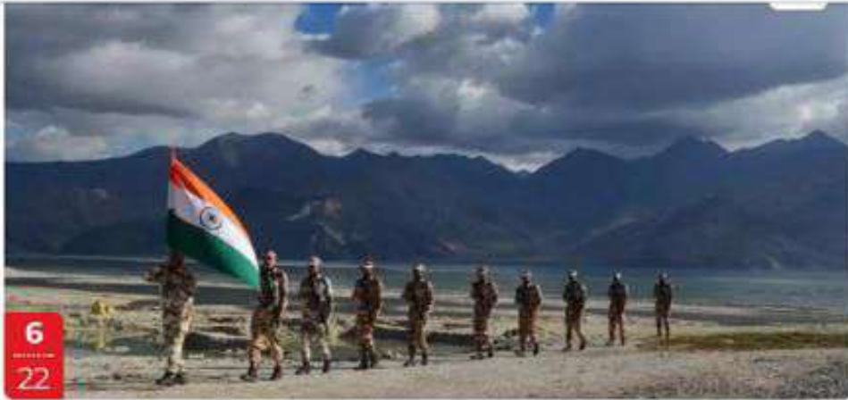
Indo-Tibetan Border Police jawans celebrate Independence Day at the banks of Pangong Tso in Ladakh