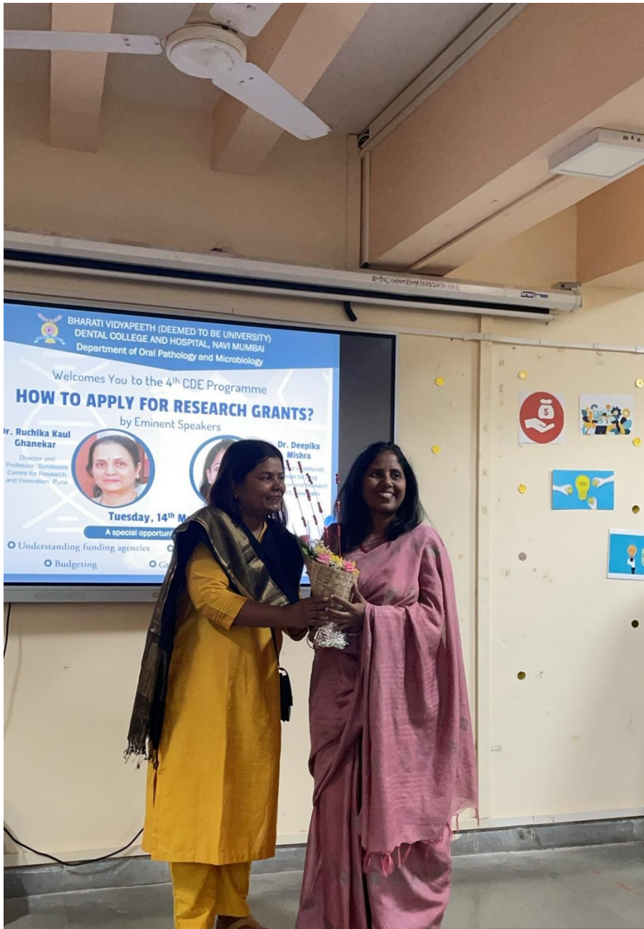
CDE on "How to Apply for Research Grants"