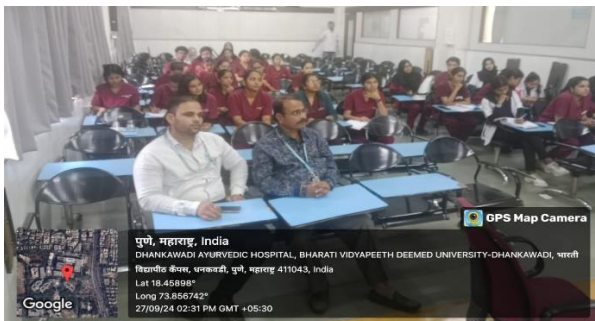
Interns Explaining topic in presence of Dr.RES