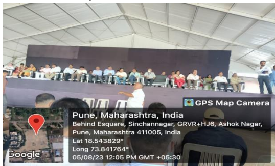
Inoguration of Mega Health check-up camp