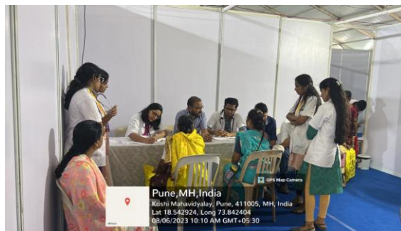
NSS volunteers check the patients