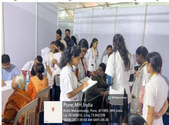
NSS volunteers check the patients.