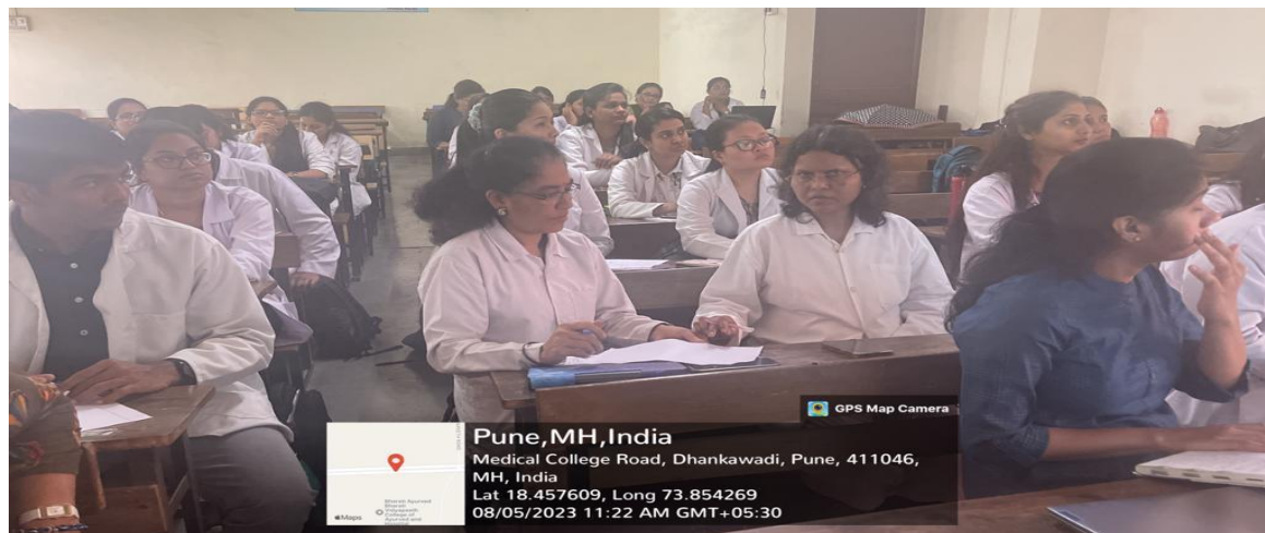
PG and PhD Scholars attending the Lecture