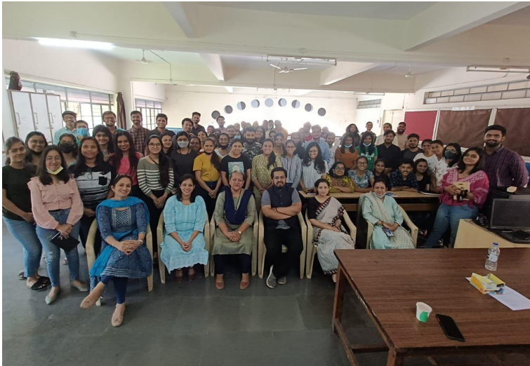
The Resource Person and Coordinating faculty with fourth Year Students.