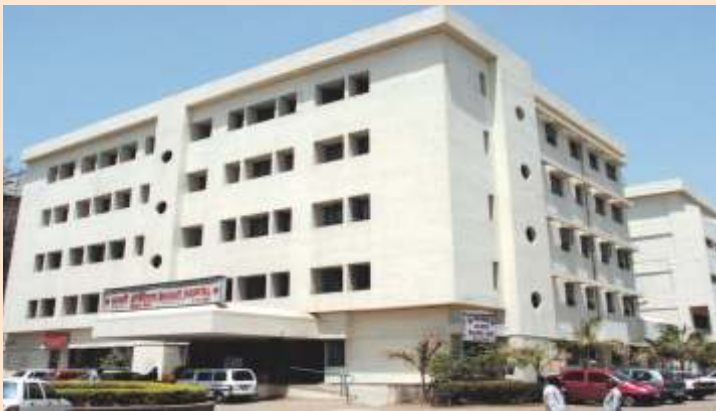
Bharati Hospital, Pune