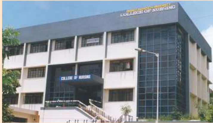
College of Nursing, Pune