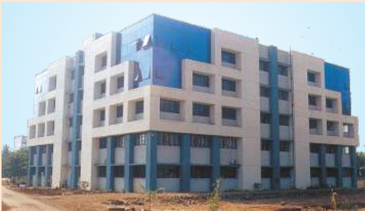
College of Nursing, Navi Mumbai