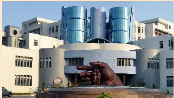
Bharati Hospital, Sangli