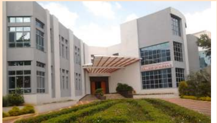
College of Nursing, Sangli